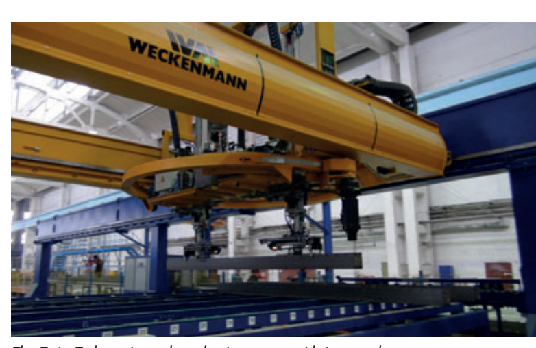
The Twin-Z shuttering robot also impresses with its speed