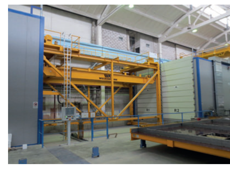
Curing chamber with hot air heating