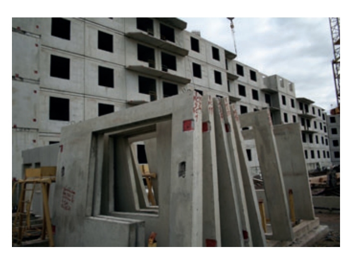
The new house building system from Blok replaces the traditional sandwich construction method by a system consisting of supporting walls and a thermal insulation composite system