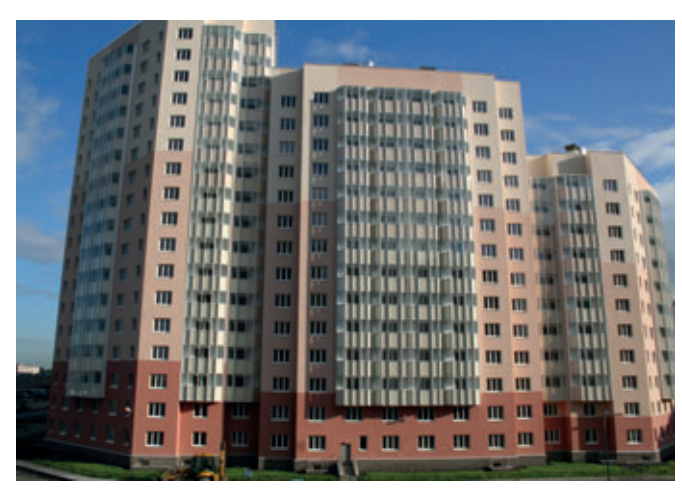
Housing complexes can now be manufactured in better quality and with shorter delivery times by the use of state-of-the-art technology from Germany.