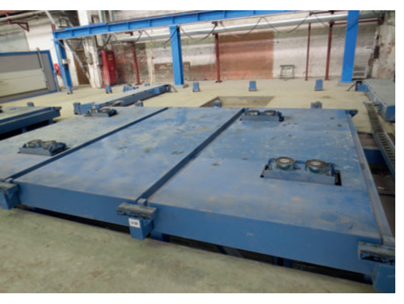
Combined shaking/vibrating station with high-performance electromagnets

A further new item was successfully realised for the first time at DSK Blok in the form of an innovative compaction system. In addition to a conventional shaking station, which makes the pallet oscillate in a longitudinal, transverse and circular direction, a high-frequency vibrating station was also installed. So that the vibration energy is transmitted directly into the pallet without a detour, the vibrators are connected to the pallet by means of high-performance electromagnets. This almost loss-free introduction of the vibrations reduces the noise level by over 10 dB, i.e. by half. Nevertheless the energy input is very intensive and the compaction result is accordingly good.